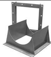
INLETS AND DISCHARGE SPOUTS DISCHARGE