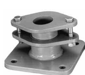
PACKING GLAND SHAFT SEAL COMPRESSION TYPE