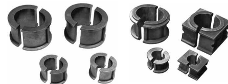
HANGER BEARINGS STYLE 220/226

Martin HARD IRON Martin BRONZE NYLATRON WHITE NYLON WOOD CERAMIC