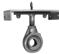
HANGER STYLE 70