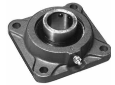
TROUGH END BEARINGS BALL AND ROLLER