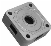
WASTE PACK SHAFT SEAL