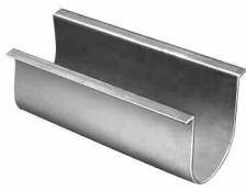
FORM FLANGED "U" TROUGH