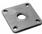
PLATE SHAFT SEAL