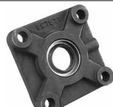
DROP-OUT SHAFT SEAL FLANGED PRODUCT