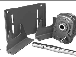
SPEED REDUCER SHAFT MOUNTED WITH ACCESSORIES.