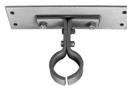
HANGER STYLE 220