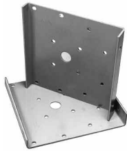
TROUGH ENDS WITH AND WITHOUT FEET