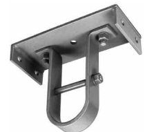
HANGER STYLE 216