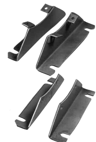
SADDLES AND FEET

Martin HARD IRON Martin BRONZE NYLATRON WHITE NYLON WOOD CERAMIC