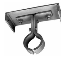
HANGER STYLE 226