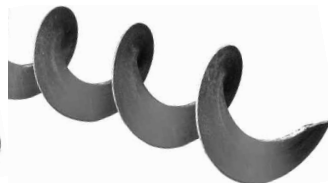
HELICOID FLIGHTING RIGHT HAND AND LEFT HAND