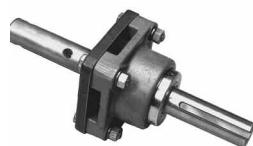
THRUST ASSEMBLY TYPE E WITH DRIVE SHAFT