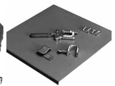
FLANGED COVER WITH ACCESSORIES

Thomas manufactures the most complete line of stock components in the industry. We stock mild steel, stainless, galvanized, and many other items that are "special order" from the others in the industry.