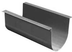
ANGLE FLANGED "U" TROUGH