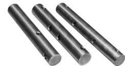
TAIL AND DRIVE SHAFTS