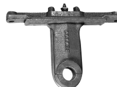
HANGER STYLE 19B