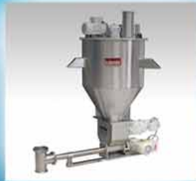
Internal Stirring Agitation Feeder 3A Dairy Twin/Single Screw