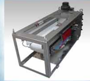
SS Belt Feeder For low headroom 5 Models