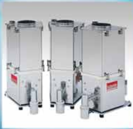
FlexWall® Plus Twin/Single Screw 3A Dairy